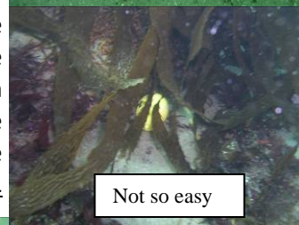
Not so easy