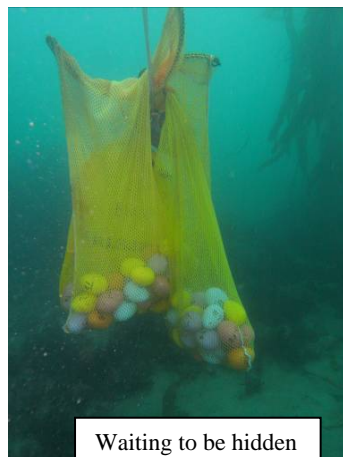
Waiting to be hidden

GREAT prizes, one for every egg and some for our raffle too! The hunt area will be at the west end of San Carlos Beach, opposite the breakwater and down the stairs from the restrooms. Everyone will need to be on the