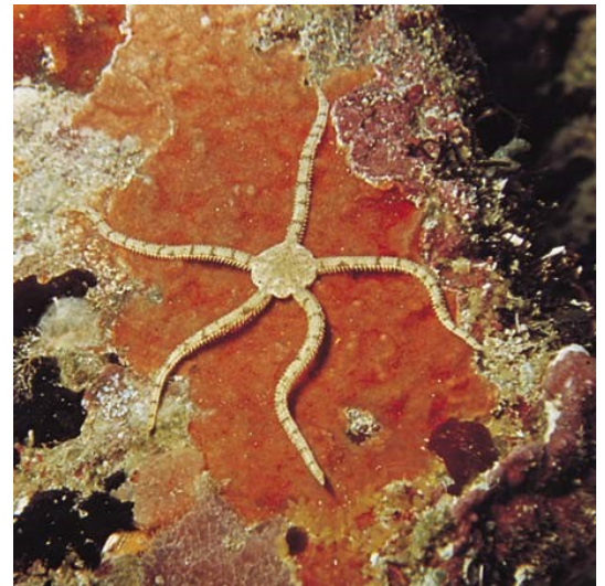
Brittle Star

If you haven't been to dive in Point Lobos State Natural Reserve I would like to strongly encourage you to join us. We will have a few experienced members who will be more than happy to show us what this fantastic dive site has to offer.