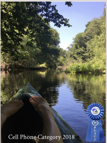
Holly Little—First Place for Cell Phone Category. Taken in Florida during a kayak ride.