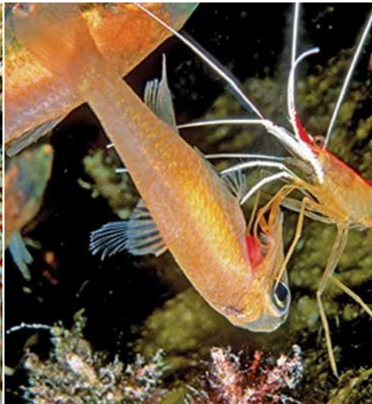
A Caribbean scarlet-striped cleaning shrimp picks beneath the gill cover of a bigtooth cardinalfish.

"Fortunately, being a vet, she was accustomed to being bitten by animals."