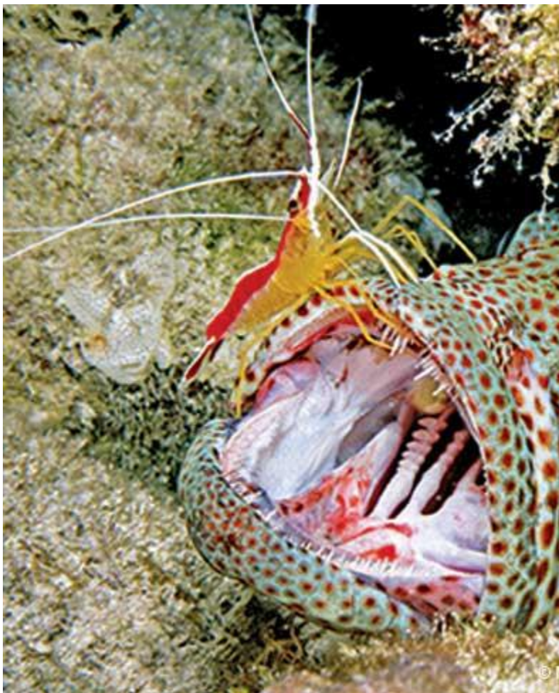
A Caribbean scarlet-striped cleaning shrimp searches for parasites inside the mouth of a graysby.