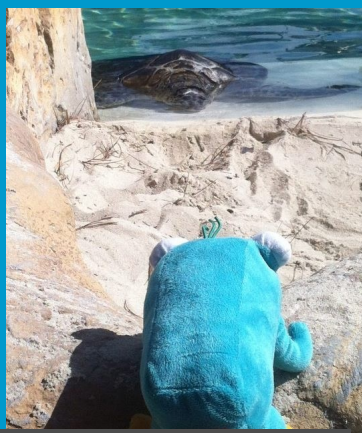
Perry vs The Sea Turtle