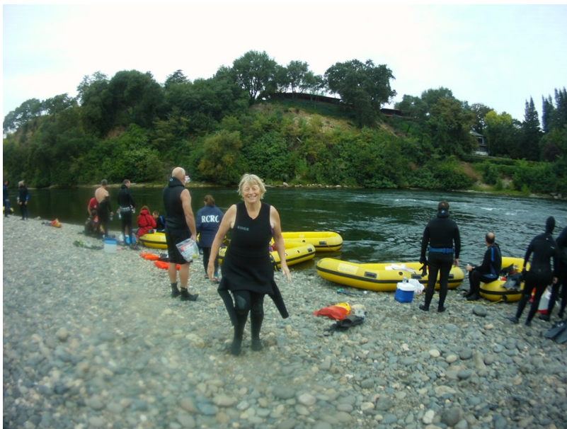
Previous Great American River Clean Up Picture

We will stop at the San Juan Rapids for a quick break, dump off what garbage we have found, then start again. About 5 hours after we start, we will end our journey at Riverbend Park.