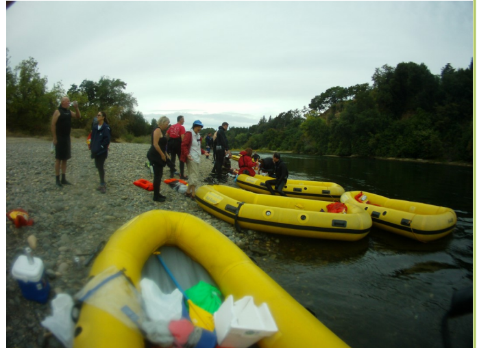
Previous Great American River Clean Up Picture

September 16 th is the day! Sponsored by the American River Parks Foundation, we will start at the Sunrise Bridge about 9 am and float down picking up cans, bottles, plastic, and whatever else we can pull up from the bottom of the river. Quite often, cameras, watches, cell phones, and other treasures are found.